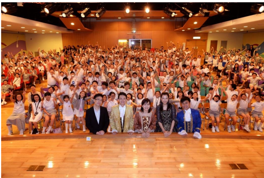
Photo 4: To nurture the next generation of vocal talent, KWIH sponsors the “K. Wah OHK Summer School”, an annual three-week intensive programme which opera training is given to talented children in areas including vocal, drama, performance, dancing and singing instruction. Through this training programme, participants will be able to experience the unique charm of the opera, elevate their self-confidence, imagination and expressive skills while broadening their horizons in in performing arts

Photo 3: KWIH and OHK encourages appreciation of operatic arts among young generation by organising education and outreach programmes, including mini opera tours and concerts in local tertiary institutions, secondary and primary schools, in which students will be introduced to renowned opera productions through stage performances and games, etc.